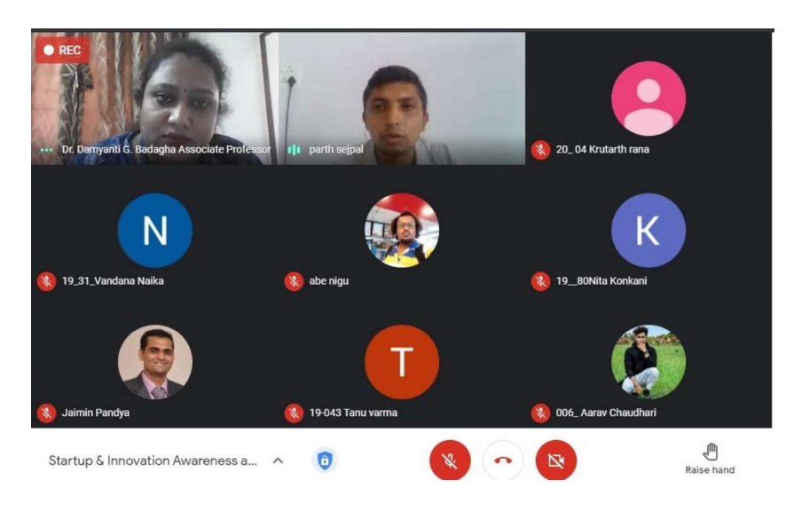
Session Photograph with Speaker, Institute Coordinator & Participants

India Council of Technical Education (AICTE), New Delhi & affiliated with Gujarat Technological University (GTU, Ahmedabad). To make aware faculty members & students about startup & innovation, SSIP & IIC cell of SNPIT & RC has organized webinar For Faculty Members & Students on 29<sup>th</sup> May ,2021 from 10.45am to 12Noon.